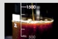
OILS AND FATLIQUORS