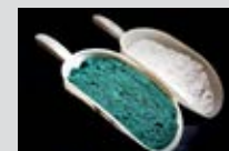
MINERAL TANNING AGENT