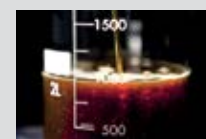
OILS AND FATLIQUORS