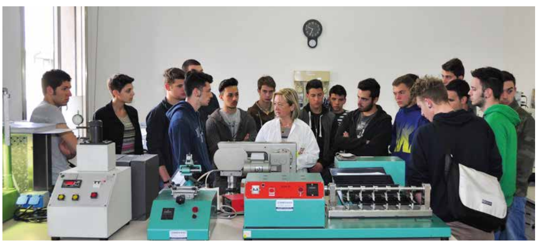
Students of the "Istituto Tecnico Cattaneo" - San Miniato